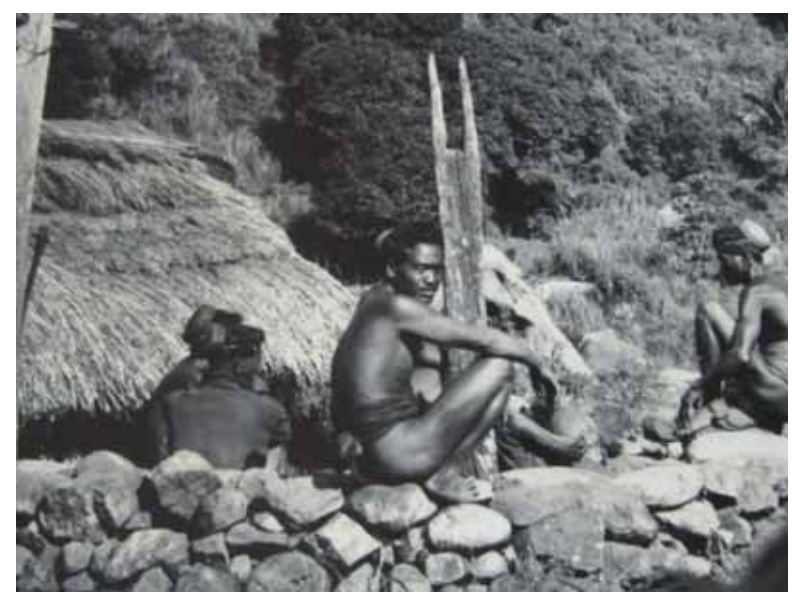
Figure 5: Photo collection of Laurence L. Wilson

In the short write-up of Dr. Salvador-Amores on the photos (2001), she notes that when the photos were discovered in a pile at the library, these were stapled together and mislabeled. Some of the photos and letters were mounted on scrap papers, making the annotations at the back of the photos hard to read or were altogether unreadable. The photos were in varying states of deterioration and were badly in need of preservation.