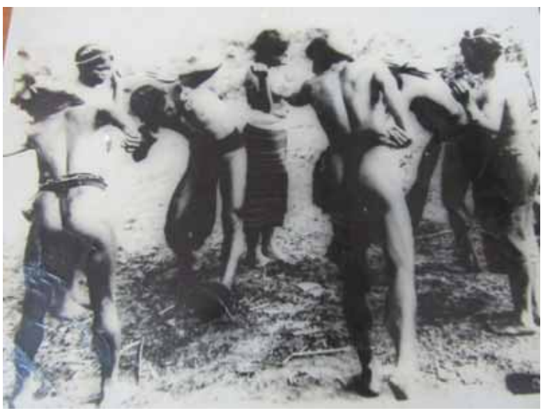
Figure 4: Photo collection of Laurence L. Wilson

Detailed in the photographs are the ordinary lives of the Cordillerans before the coming of the Spanish colonizers: native clothes and adornments, tattoos on skin, economic activities – like farming and agricultural activities, mining, weaving, gold panning –, native houses and abodes, rituals and festivities and burial caves. Also widely photographed are Baguio and its environs at the turn of the 20th century and political figures who governed the then Mountain Provinces as well as notable individuals who made enduring contributions to the early history of the region. Along with the photographs are film negatives, which upon close examination reveal images of individuals clad in native clothes and bearing spears and shields, bululs , skulls and rice terraces.