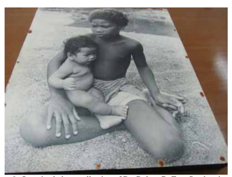
Figure 9: Oversized photo collection of Dr. Robert B. Fox, Sr. showing rust

The extensive photograph collection consists of aerial photos of uninhabited Palawan, Ayta Negritos, stoneware jars and ceramic wares, Cordillera photographs, self and family portraits among others. Majority of the photograph collections are either in sepia and black & white. A group of black and white, oversized photos on the different Philippine indigenous peoples are mounted on wood. The nails used in fabricating the wooden frame have started to rust and have spread to the photos. Also among the collection are manually drawn maps of selected barrios of Palawan, the site of his Tagbanuwa research. His interest in this group of indigenous Philippine people inspired him to write about their religion, customary laws, material culture and societal system.