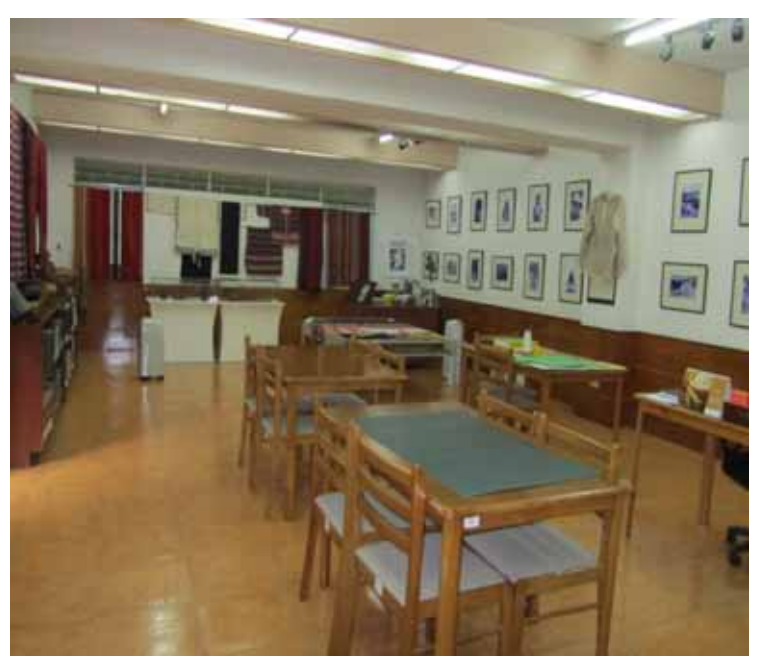
Figure 3: The Cordillera/Northern Luzon Historical Archives

With the vision of the UP Baguio to become an academic institution devoted to the development of Cordillera studies, the archives is seen as a means of achieving this vision of the parent organization. The archives' mission, aside from being a repository of primary sources on the Cordillera, aims to collect as humanly possible all known sources written on the Cordillera. The archives is seen, therefore as a means to achieve the vision of UP Baguio.