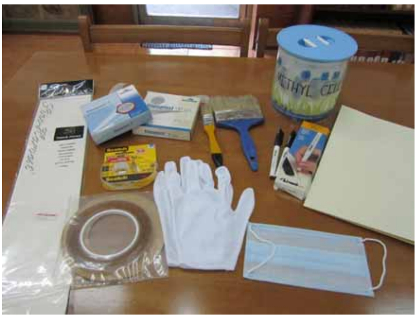
Figure 13: Archives preservation supplies