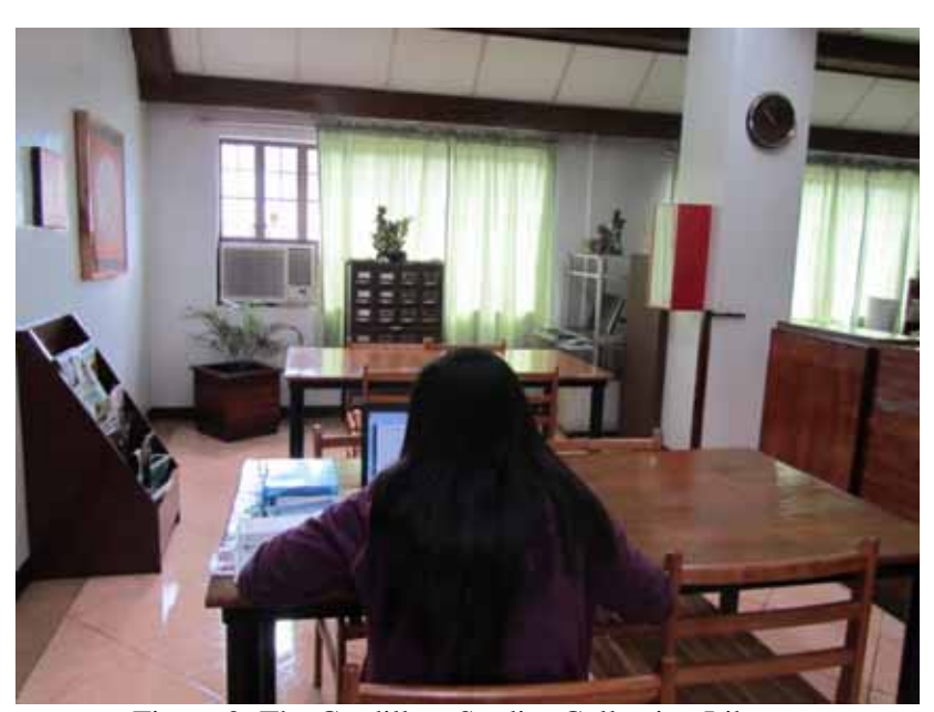
Figure 2: The Cordillera Studies Collection Library

The Cordillera Studies Collection Library traces its history to the establishment of two libraries in the academic community of University of the Philippines Baguio under two different organizations. First, the Cordillera Section of the Main Library's Filipiniana Section and a Library under the Cordillera Studies Center, the research and extension arm of the Social Sciences Division, now the College of Social Sciences. With their aim of acquiring information sources on ethnography, ethnology, communication, language and literature, ancestral land issues and other related fields of interest that focused on relevant issues specific to the highland communities of the Cordillera Region, the two libraries were in fact duplicating functions and collections.