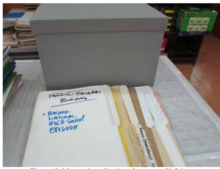
Figure 10: Manuscript collection of Augustus U. Saboy

Real life cases of conflict resolution and settlement through indigenous customary process are documented in the different papers making up the Saboy papers. Newspaper clippings on important Kalinga-Apayao affairs and political events have been collected and compiled by Mr. Saboy. A number of photographs as well as photo film negatives make up the collection.