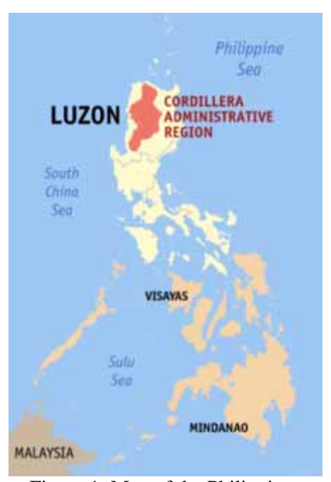
Figure 1: Map of the Philippines

ey, Ibaloy, Ifugao and Bontok. It has the second largest concentration of indigenous groups of people, next to the island of Mindanao. The geographic condition of the region earned them the collective name Igorots, from the Spanish word Igorrotes which means "of the hill or mountain." Partly due to its rugged terrain and largely to their resistance, the inhabitants of the region were not easily subdued by the Spanish conquistadores of the 18th century (Scott, 1977). They resisted efforts by the Spanish government to put them under their control. For this, they were regarded uncivilized, infieles (pagans), fierce and barbaric. Their non-assimilation into mainstream Spanish rule made the Cordillerans adhere to a society free of Western influence.