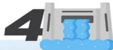
CALANASAN DAM 120 MW