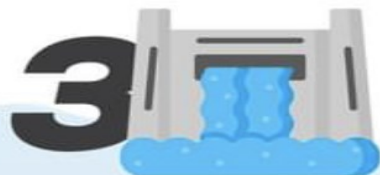
AOAN DAM 50 MW