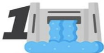
GENED-1 DAM 150 MW

The Department of Energy awarded 4 Apayao dam projects to Pan Pacific Renewable Power Philippines Corporation (PPRPPC).