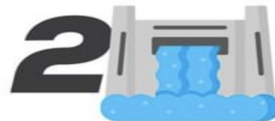
GENED-2 DAM 335 MW